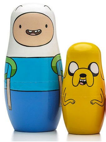
Fan art matryoshkas are an option too...