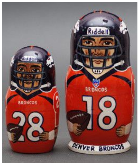
You could choose to create sports matryoshkas...