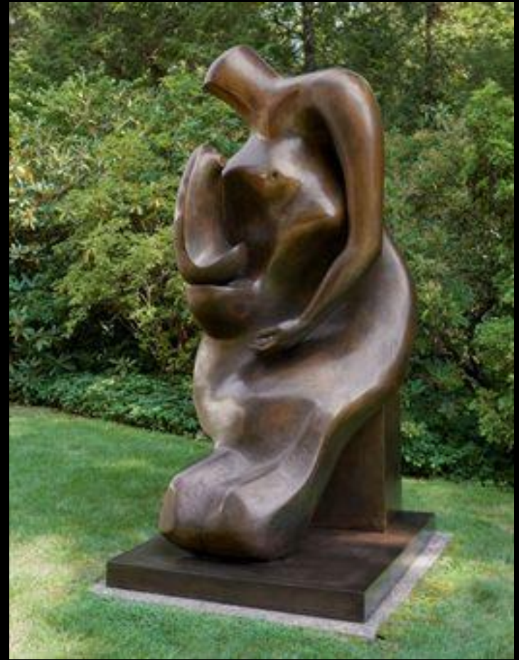
Henry Moore. Mother and Child Block Seat . 1983-1986.