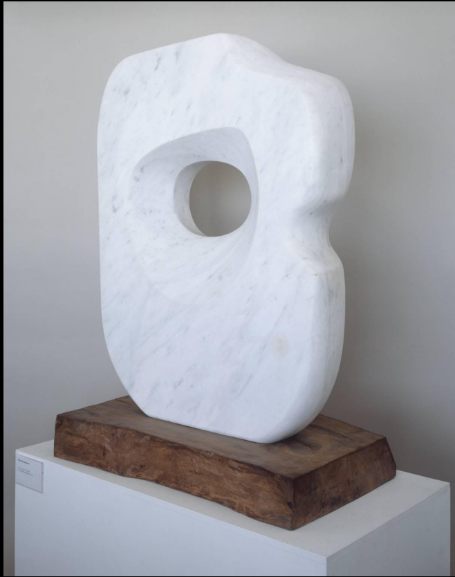
Barbara Hepworth. Pierced Form . 1963-64.