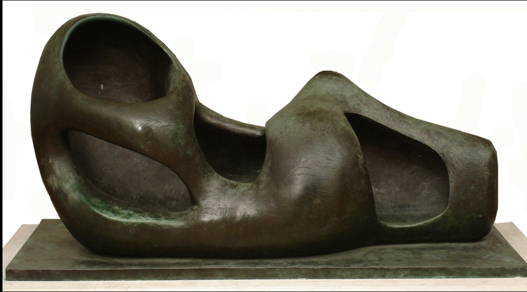
Henry Moore. Reclining Figure: External Form . 1953-54.