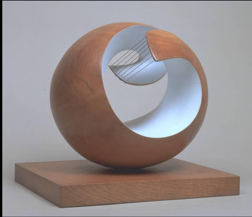
Barbara Hepworth. Pelagos II . 1946.